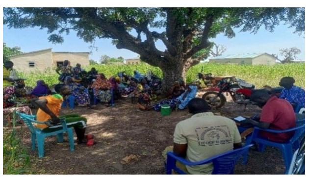
Nambouli village assembly to establish infrastructure management committee, October 2023

The "Wéi" project promotes the stabilization and prevention of violent conflicts in the Atacora region of northern Benin, which is heavily affected by conflicts between farmers and herders, insurgent attacks and tensions around access to natural resources in national parks. It promotes access to and management of green economic and social infrastructure, supports local mechanisms for preventing and resolving conflicts, improves the management of natural resources, and strengthens cross-border cooperation.