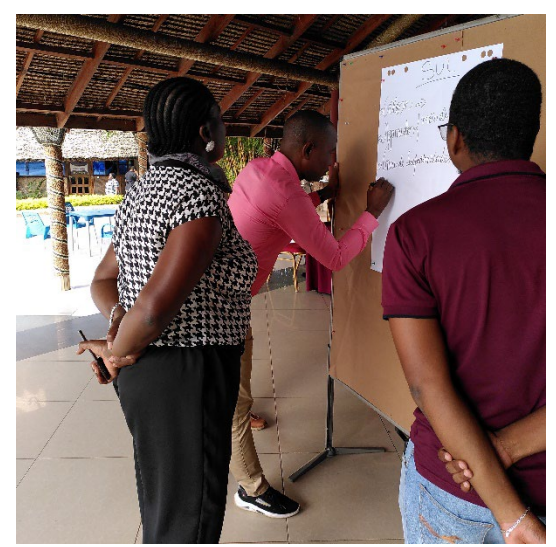
Conflict sensitivity workshop in Nampula, Mozambique

Conflict sensitivity is the awareness that our work, presence, and behavior can have unintended consequences. It means taking action to avoid negative effects and reinforce our positive impact. Conflict sensitivity is integrated into all Helvetas' programs, along with the related topics of gender sensitivity and social inclusion, and we support partners and clients to do the same.