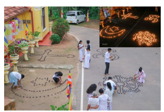
Youth respecting religious diversity by celebrating 'Vesak'

The project promoted reconciliation and social cohesion by involving youth in inter-ethnic, inter-religious, inter-generational and inter-cultural development. Young Sri Lankan women and men from different backgrounds received training and were supported to build relationships across ethnic and religious boundaries and to promote positive social change in their communities. Youth-led cooperatives and social enterprises were initiated to build capacities in mitigating the socio-economic drivers of violent extremism.