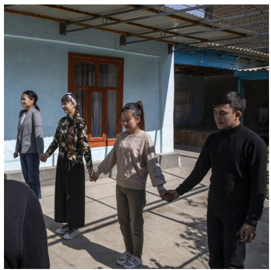
A personal development training for youth in south Kyrgyzstan

The Youth United for the Future project (YOU) helps young people to identify their personal and professional purpose in life and promotes constructive dialogue between young people and adults. By supporting the meaningful participation of young people in family, social and public life, the project contributes to a more cohesive society and reduces the vulnerability of young people to engaging in activities leading to violence.